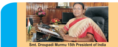
Smt. Droupadi Murmu 15th President of India